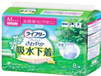
Unicharm's Lifree Slimwear Sawayaka Absorbent Underwear